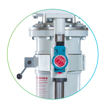
Hydraulic lift limit switch